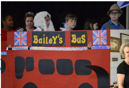
4th Grade's Grandparent Day skit