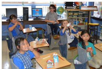
2nd grade enjoys their snack.